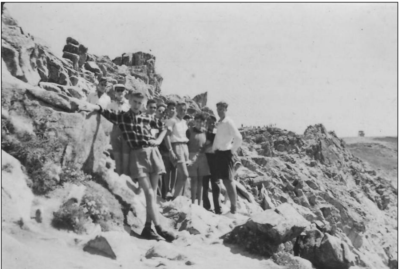
POINTE DE RAZ