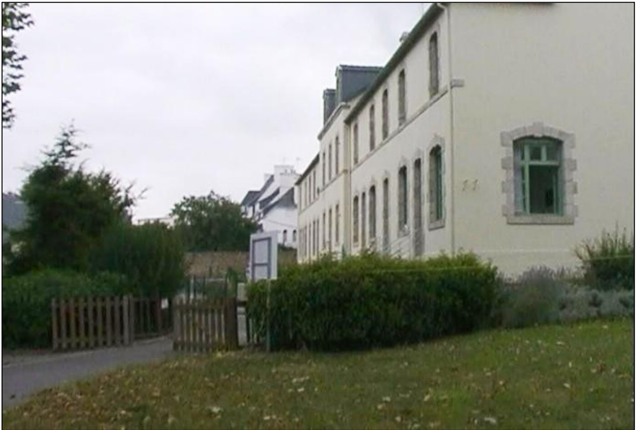
SCHOOL HOUSE 2000