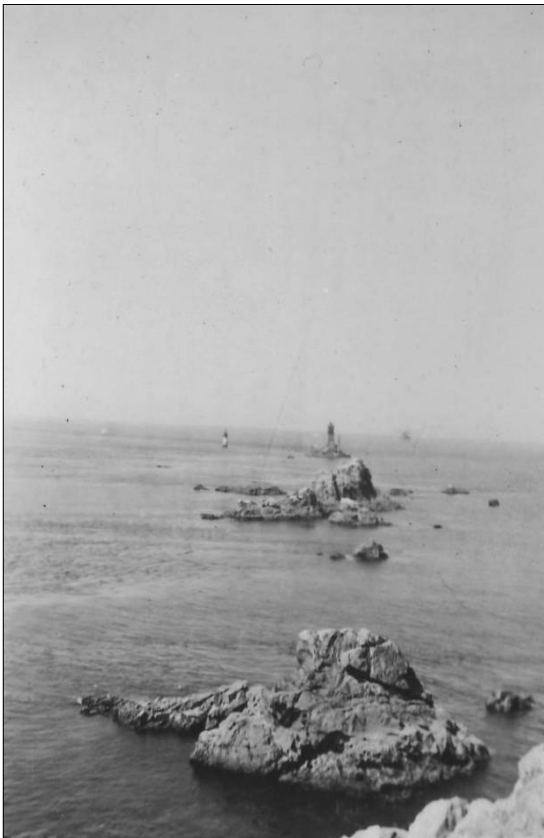
POINTE DE RAZ 1955