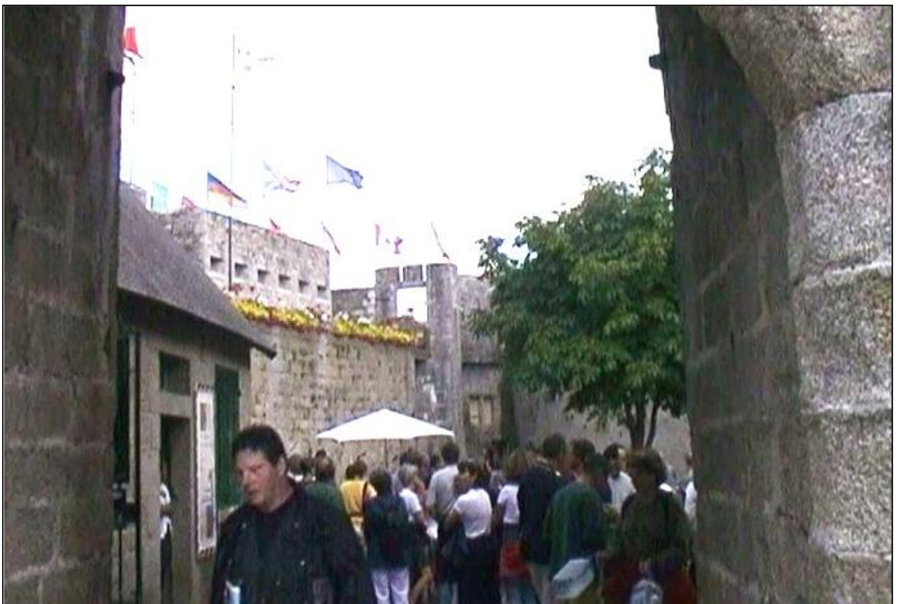
CONCARNEAU OLD TOWN 2000