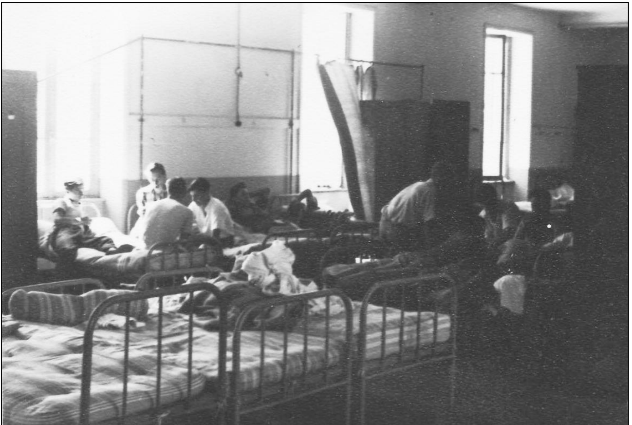
A DORMITORY 1955