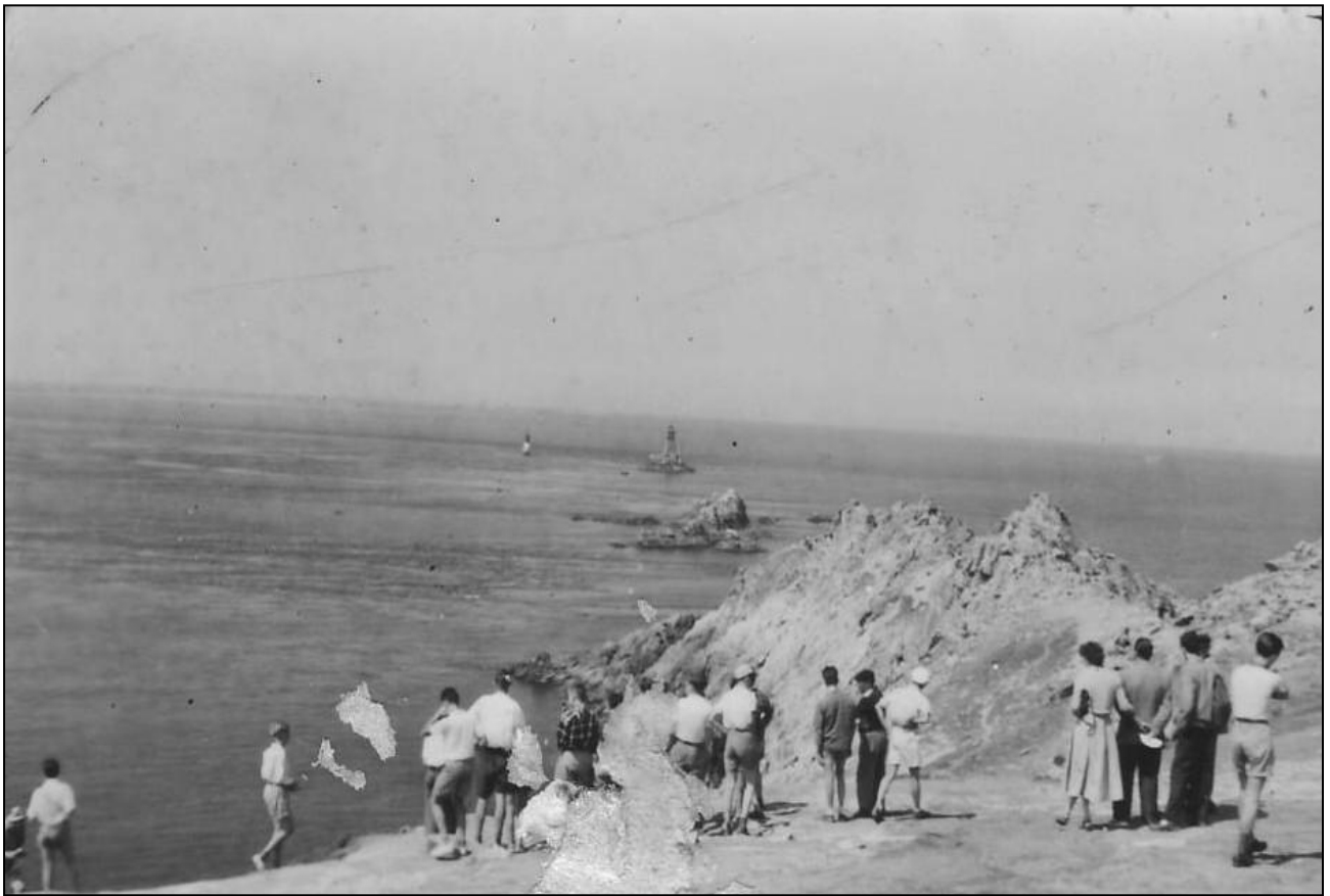
POINTE DE RAZ