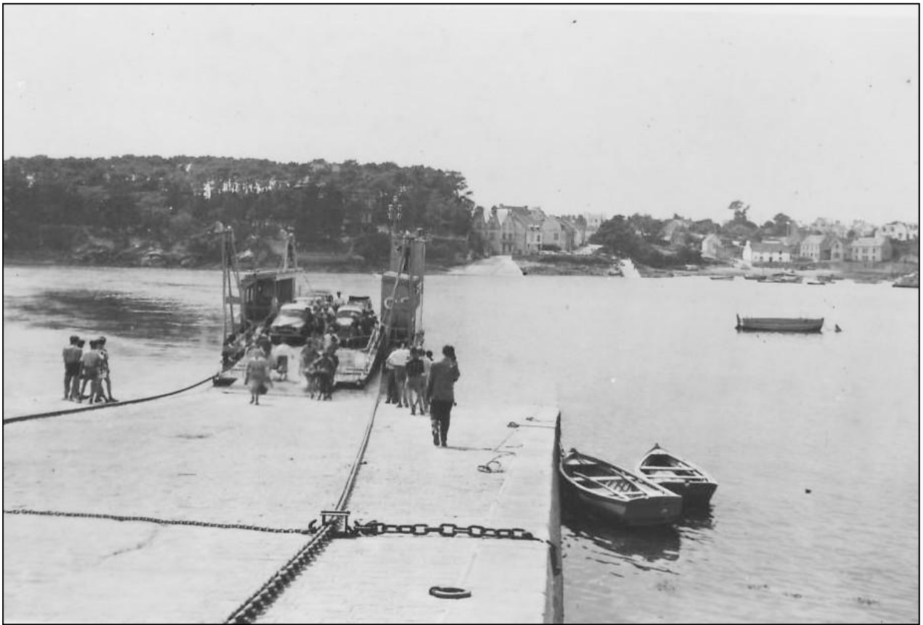
BENODET CHAIN FERRY 1955