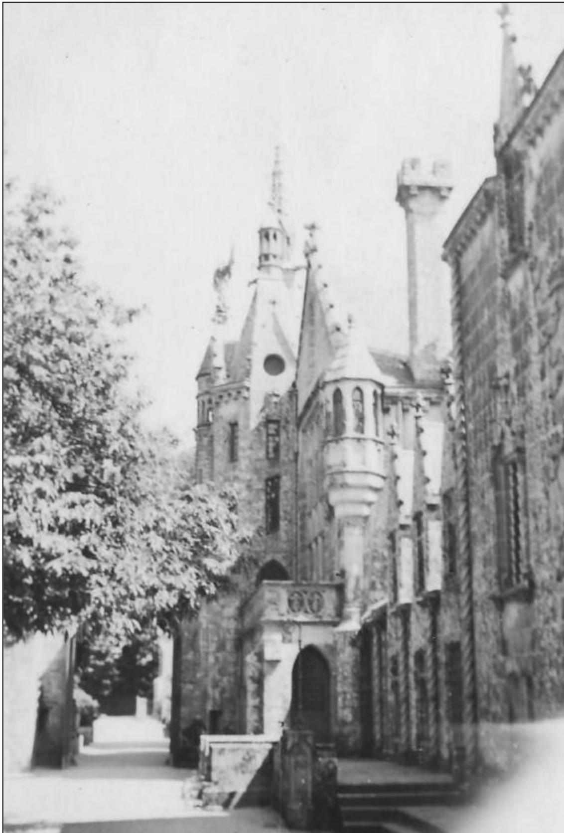
CHATEAU KERIOLET 1956