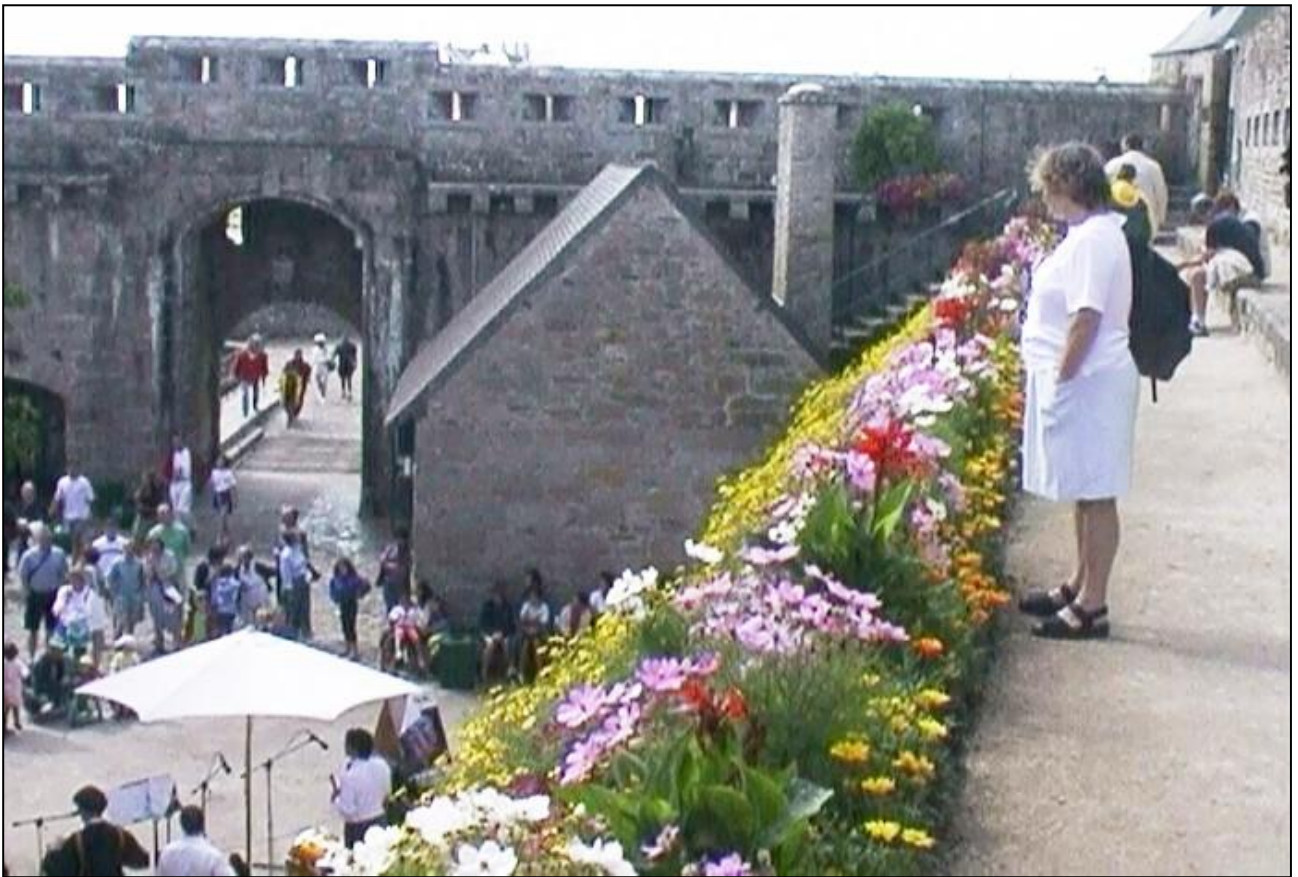
CONCARNEAU OLD TOWN SQUARE 2000