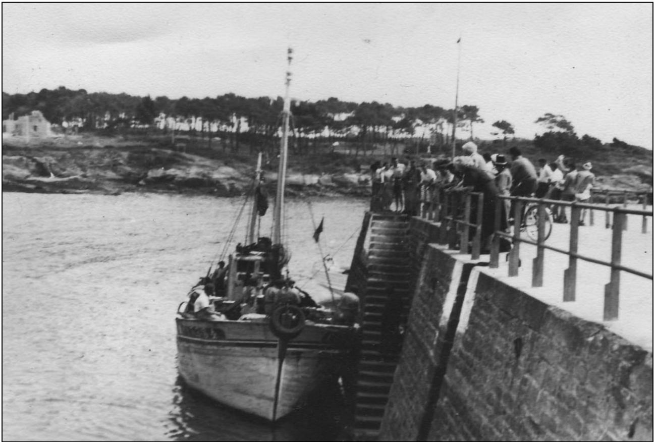
CONCARNEAU HARBOUR JETTY 1955