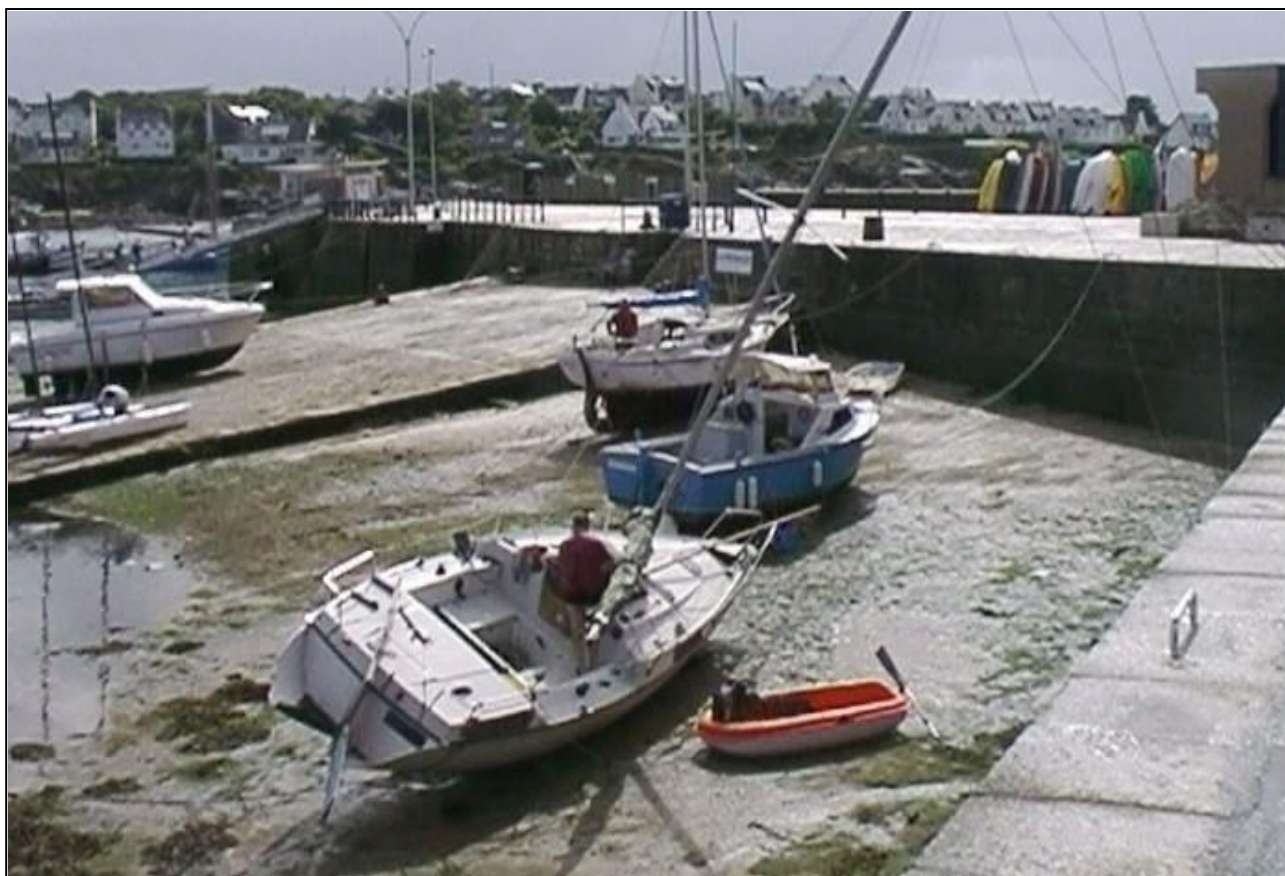
CONCARNEAU JETTY 2000