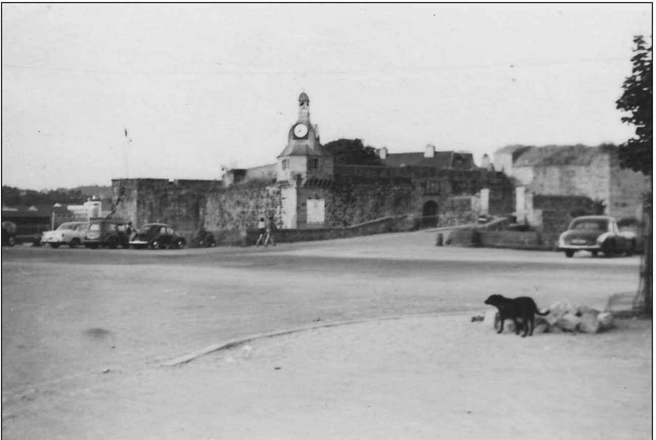
CONCARNEAU OLD TOWN 1955