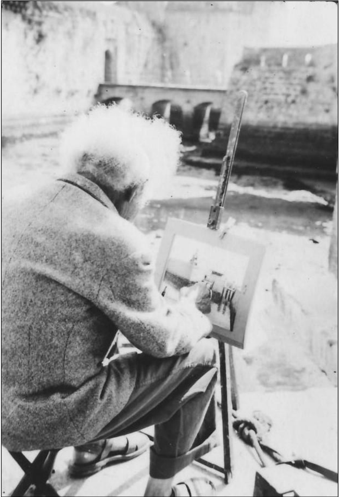
A PAINTER BY THE OLD BRIDGE 1955