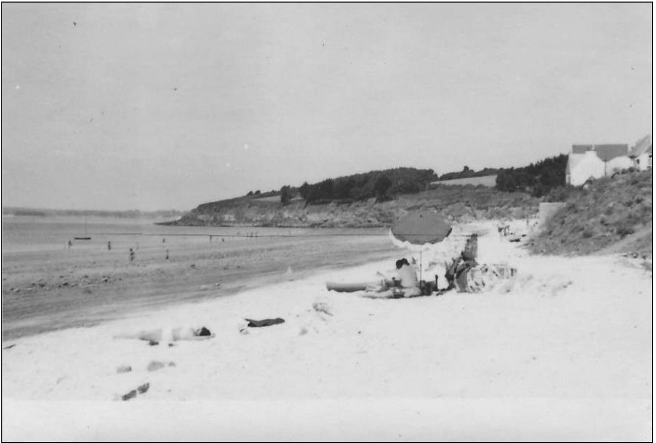
CONCARNEAU BEACH 1955