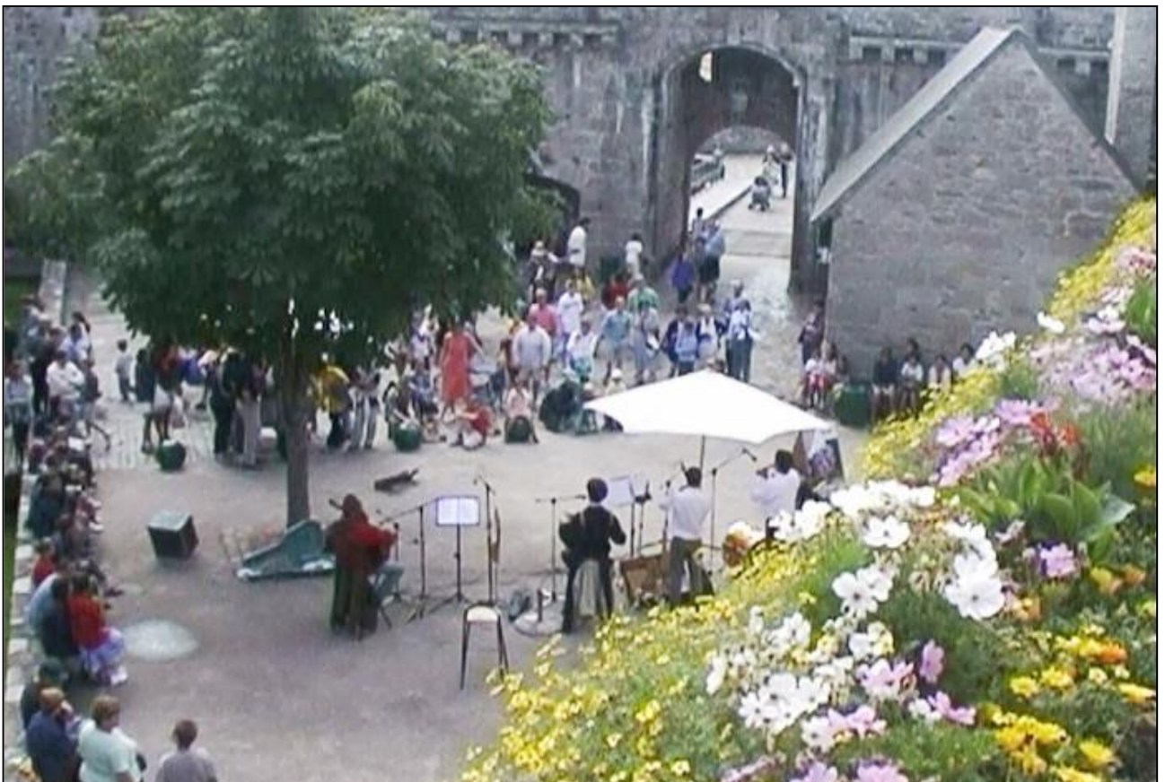
CONCARNEAU OLD TOWN COURTYARD 2000