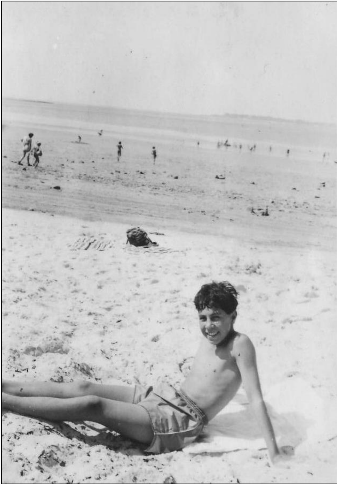
CONCARNEAU BEACH 1955