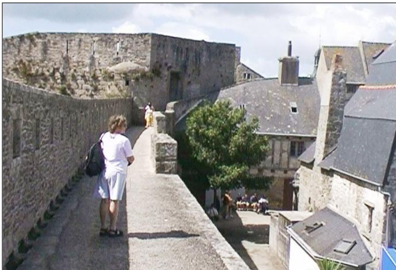
CONCARNEAU OLD TOWN WALL 2000