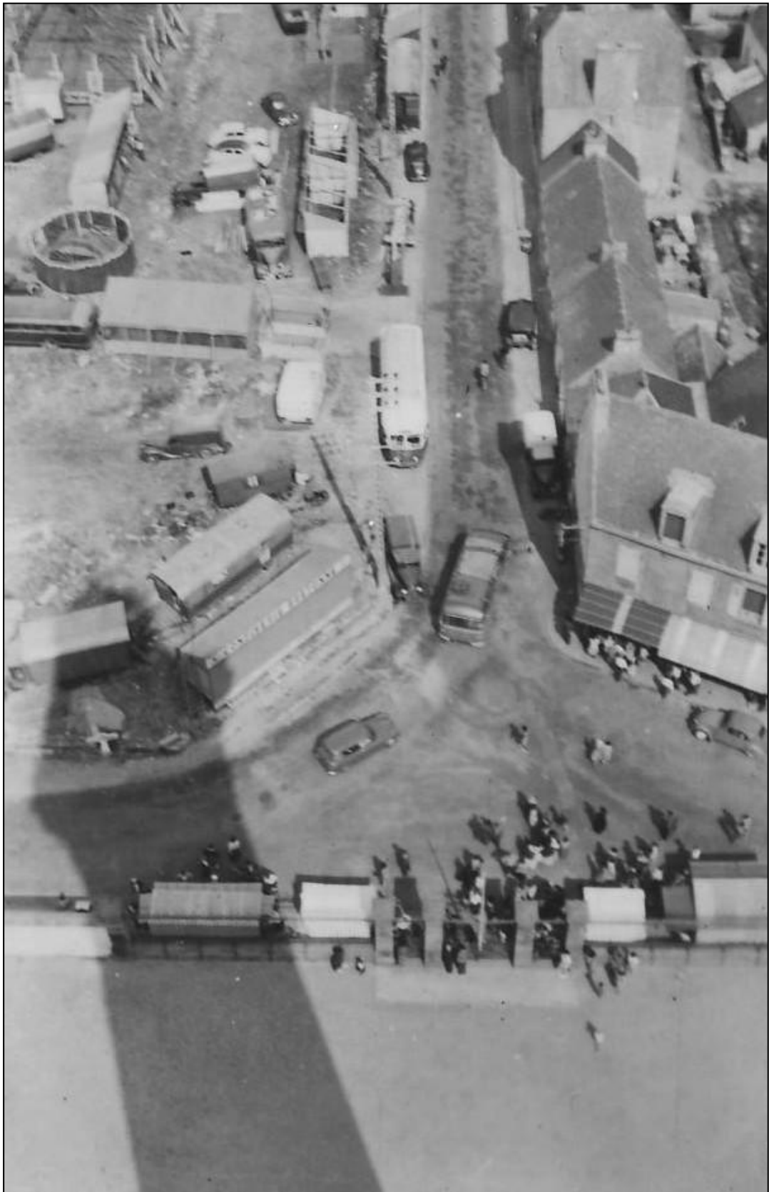
VIEW FROM BENODET LIGHTHOUSE 1955