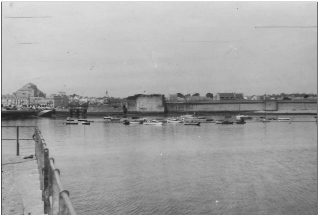
CONCARNEAU HARBOUR 1955