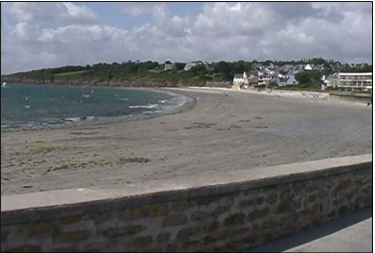
CONCARNEAU BEACH 2000